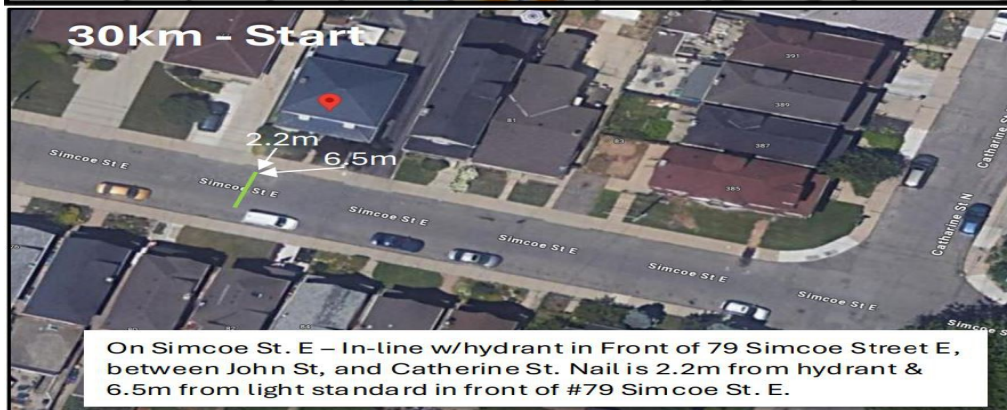
30km - Start On Simcoe St. E – In-line w/hydrant in Front of 79 Simcoe Street E, between John St, and Catherine St. Nail is 2.2m from hydrant & 6.5m from light standard in front of #79 Simcoe St. E.

Athletics Canada Certified ON-2024-056-BDC Certification Expires Dec 31/2034