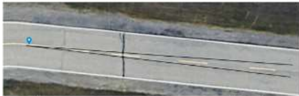
Path measured for turn around point

Turn around point is 7.02m up from the end of the solid yellow dividing line in the middle of the road just before the road curves. Cones will be placed in the middle of the road along this out and back section to keep the runners to their right on the course.