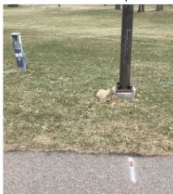
The entire course runs out and back along the South Meewasin Trail on the West side of the South Saskatchewan River. Runners stay to their right on the course.

Start/finish line is in line with the brown light post near the grey utility box on the paved pathway leading to the Victoria Park skatepark.