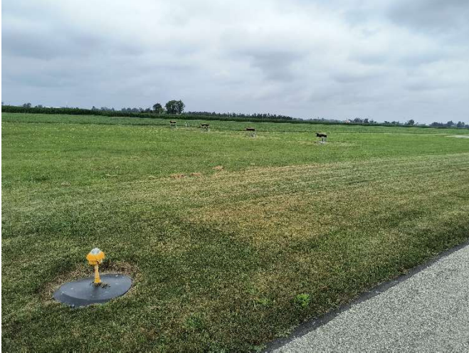
Runners turn around 3.5m SW of yellow light, SW of 4 large lights on west side of runway.