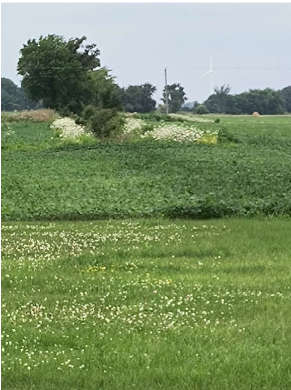
2k- in line with SW side of drainage ditch on North side of runway.